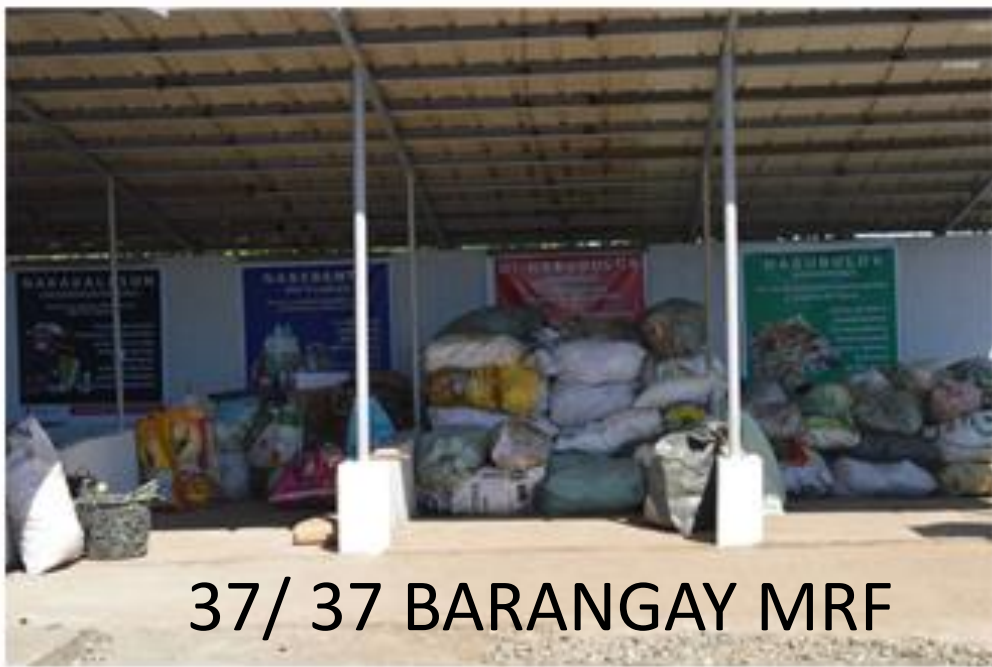
37/ 37 BARANGAY MRF